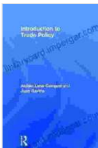
Image Alt: Cover of 'Introduction to Trade Policy' by Aluisio Lima Campos featuring an abstract depiction of international trade flows and economic indicators