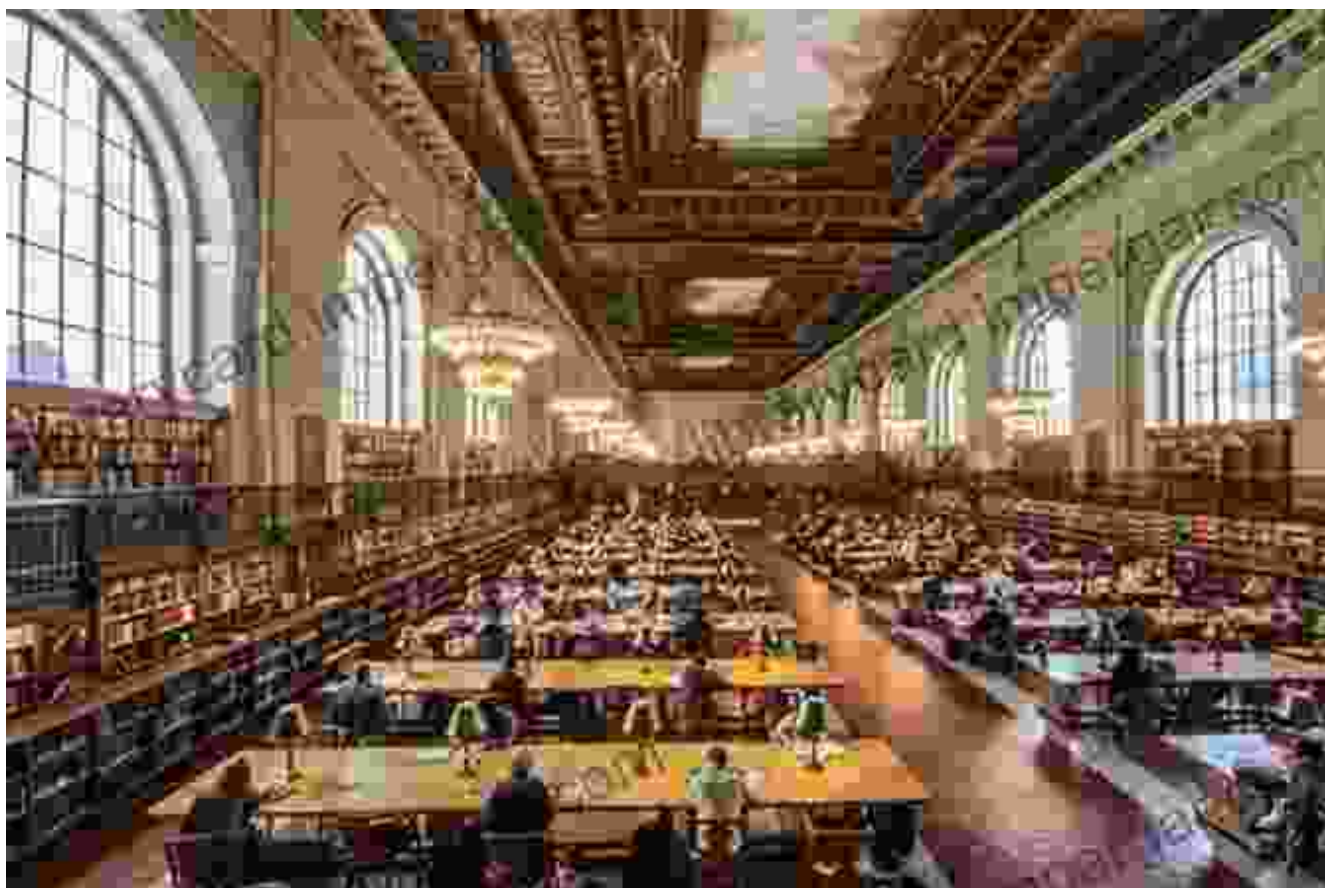
The New York Public Library

Library, which was completed in 1911. The library is a magnificent building that is one of the most iconic landmarks in New York City.